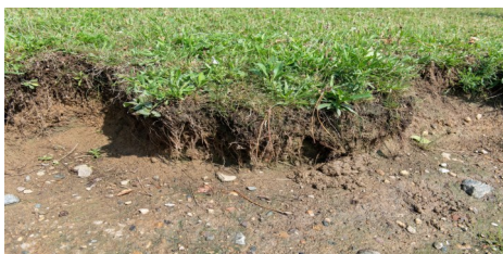
Crayfish burrow along pond banks contributing to erosion along the shore.

A great way to help prevent the spread of aquatic species is to clean, drain, and dry boats before moving to new lakes to prevent aquatic hitchhikers. One effort to help control or prevent the spread of this invasive could be to support habitat for predators like wood ducks. This Saturday, January 25th, our On the Ground program will be at Shiawassee River State Game Area with volunteers to maintain wood duck boxes. We will be doing a similar project on February 15th at Maple River State Game Area, if you are interested, sign up here!