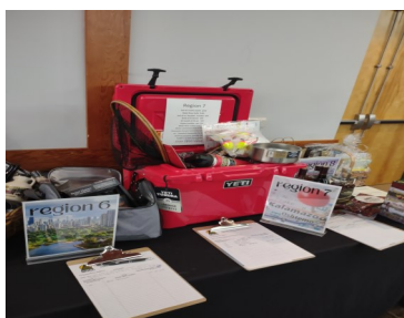
Region 7 basket made $600