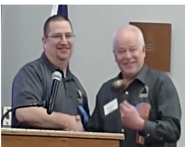
Passing the gavel